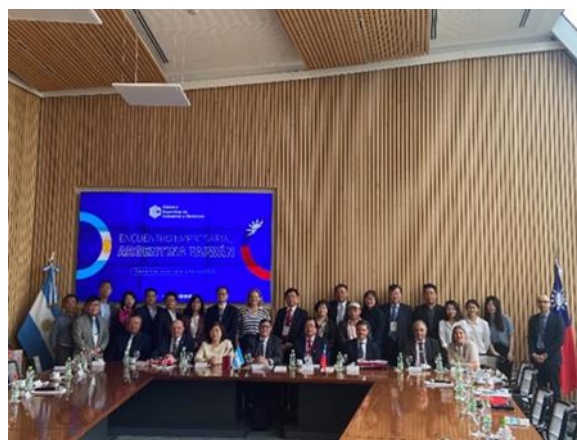
A group photo of the 9 th Taiwan-Argentina Joint Business Councils Meeting for VIP guests.